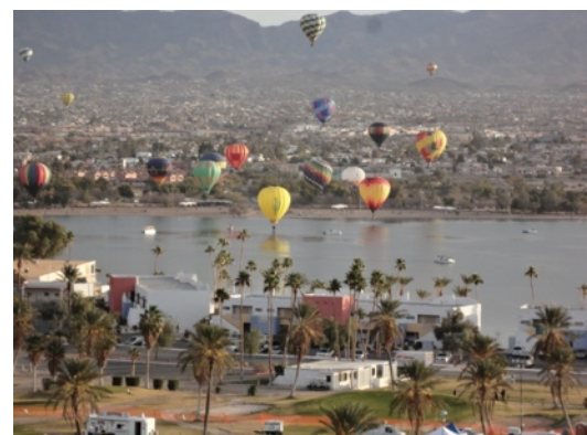
Everybody having fun