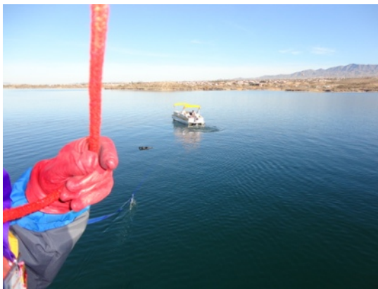
The tow from the air