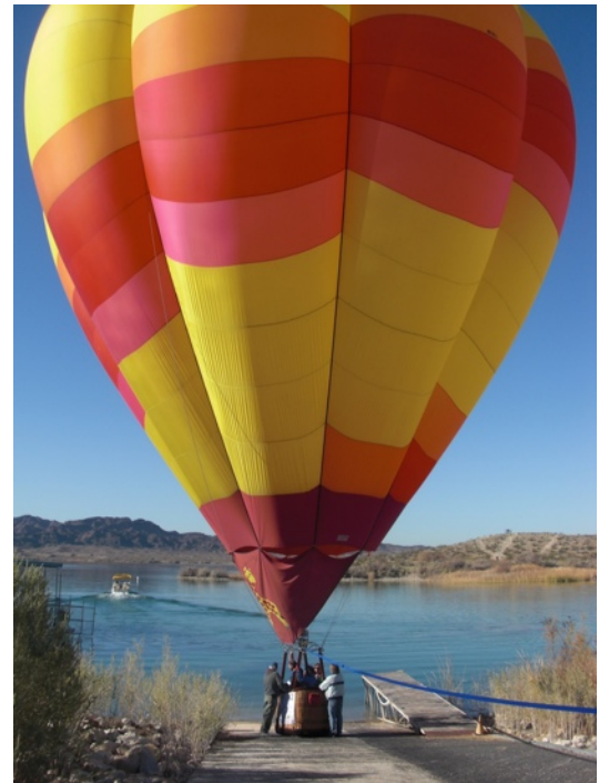
Finally back to shore