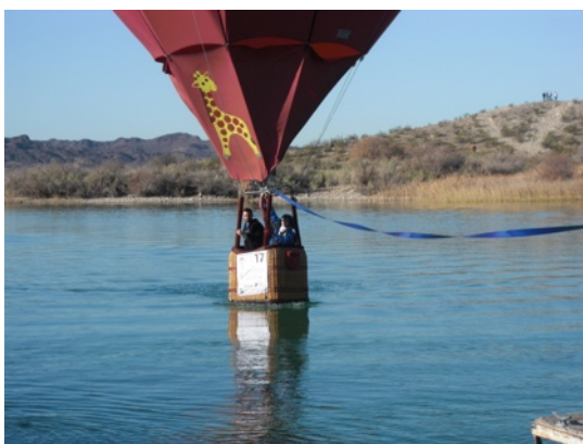
The tow provides an opportunity for a splash-no dash