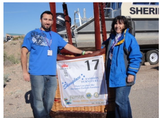
And the results- wet feet!